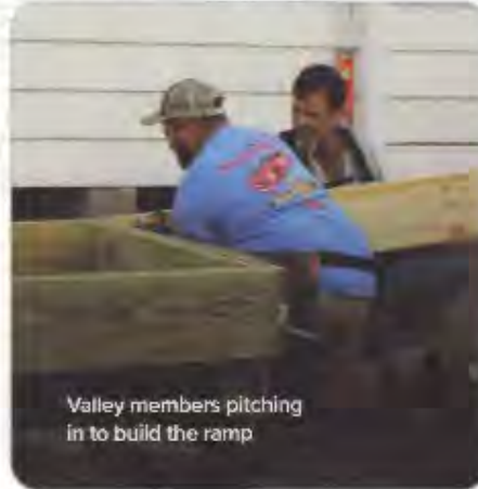
Valley members pitching in to build the ramp