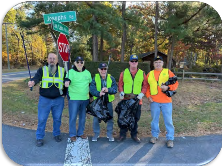
Road Clean-up – Lewes, DE Nov. 01, 2025