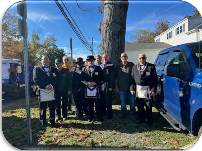
Sea Witch Parade Oct. 25, 2025