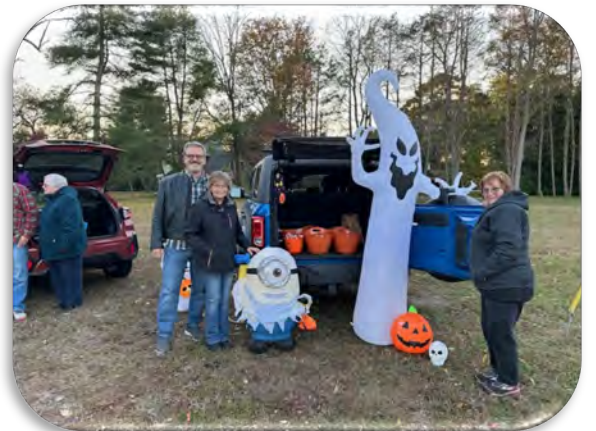
Milton, DE Oct. 31, 2025