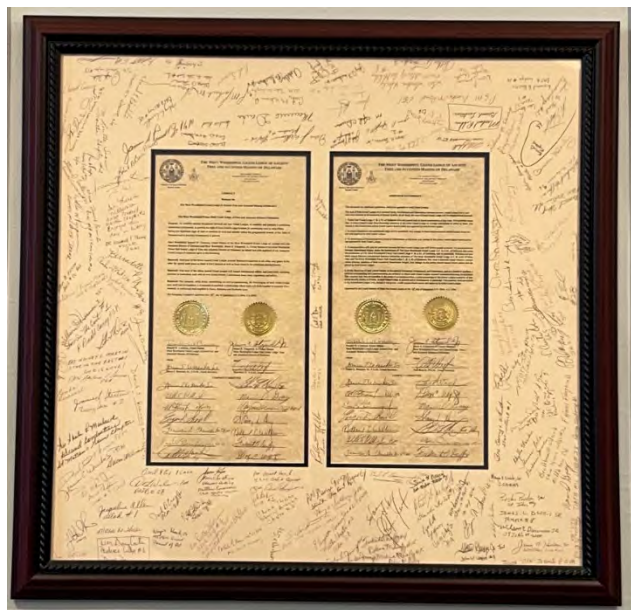
Pictured: The Signed Compact and Amendment between the two Delaware Grand Lodges on display at in the Grand Opera House and Masonic Temple.

“Behold, how good and how pleasant it is for brethren to dwell together in unity...” - Psalm 133:1